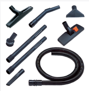
Accessory kit for VL1-15 und VL1-30

Form, colour and design are subject to change without prior notice for the benefit of further technical development. Images may show optional equipment. *Option