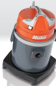
Cleanserv VL1-15 Cleanserv VL1-30