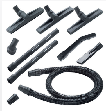
Accessory kit for Cleanserv V L3-70 I