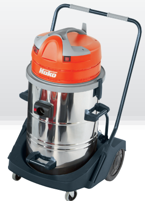
Cleanserv VL3-70 I