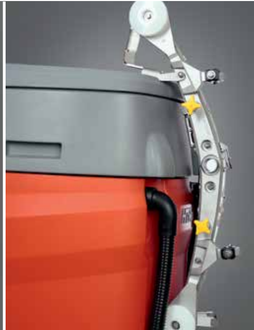
Clearance width 76 cm Ideal for checkout areas